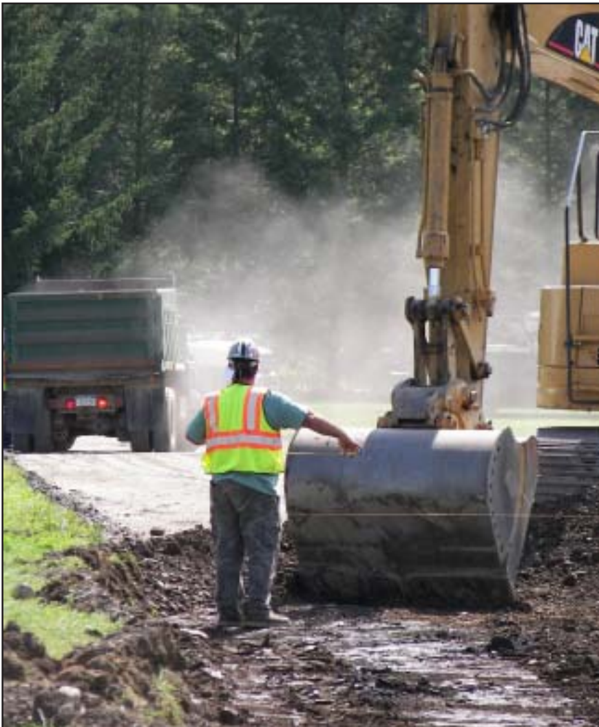
Above, a work crew dismantles the parking lot at Owego Elementary. The lot, as well as the OES driveway, will be completely reconstructed by the start of school in September. At right, a crew puts the finishing touches on the sidewalk replacement at Owego Free Academy.