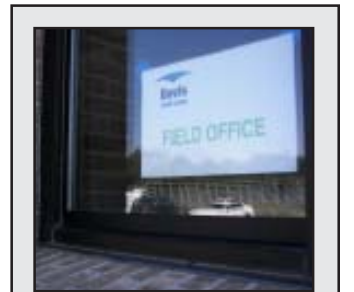
A project directory, listing the main contact for the project, as well as the primary contractors performing work in the OA schools during the capital project, is on Page 4. The field office for the project management company, Bovis Lend Lease, is currently located at Owego Free Academy.