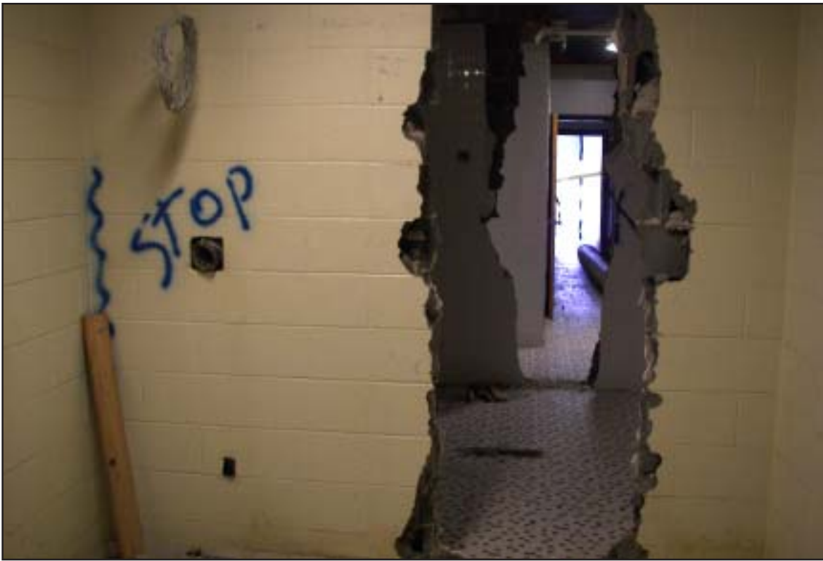
Above, work crews gave themselves easy access to different areas of the high school's locker rooms during the first phase of the district's capital upgrade project that began this summer. The boys' and girls' locker rooms are being completely refurbished as part of the project. At right, a crew works on the resurfacing and repair of the OFA tennis courts on August 13.