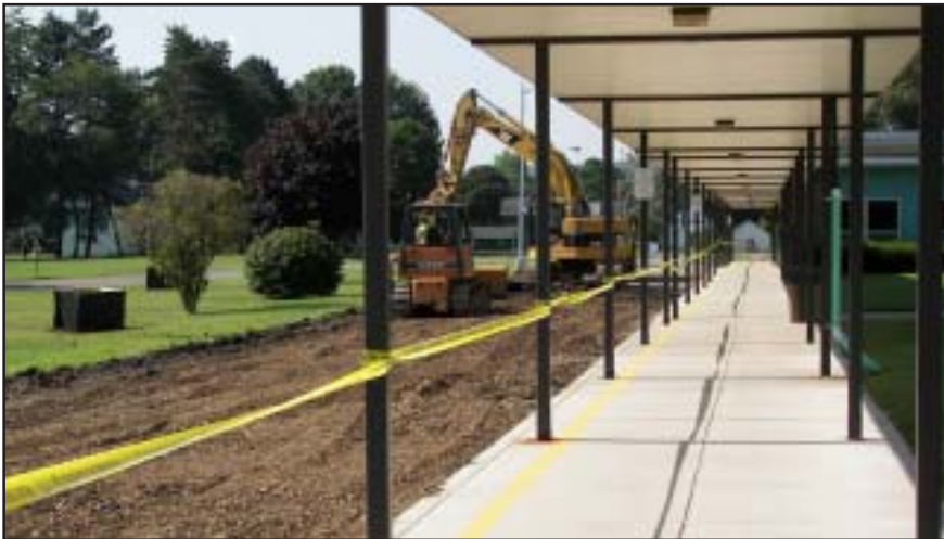
Above, the driveway at Owego Elementary will be completely resurfaced when school begins in September. This photo was taken on August 3. At right, a view of the district's new scoreboard located at the soccer pitch.