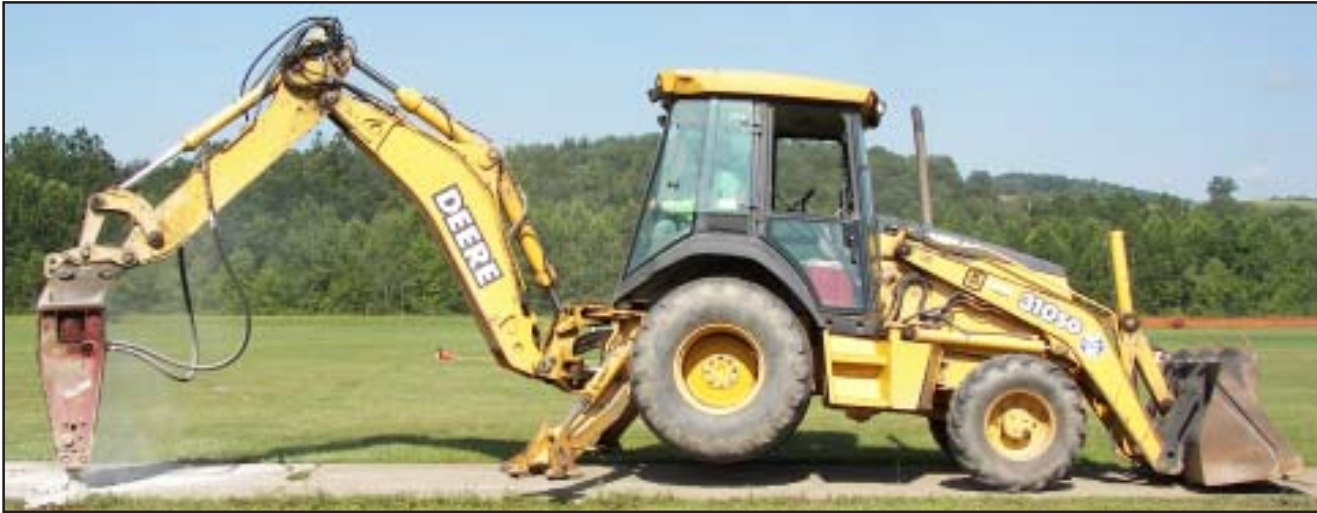
Above, the sidewalk between Owego Elementary and Owego Free Academy was being torn up in this August 3 photo, as the first step in the reconstruction of many sidewalks, driveways and parking lots on the Owego campus.