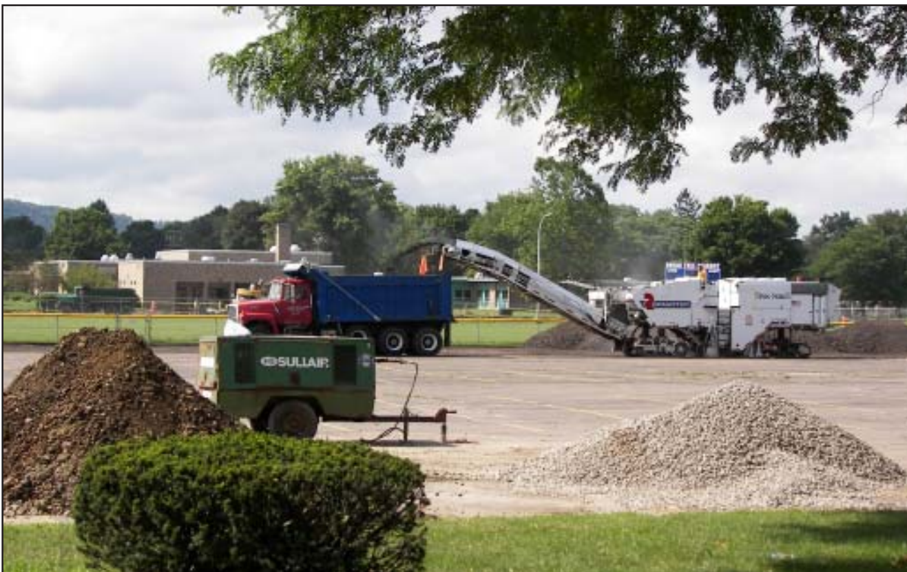
Above, the student parking lot adjacent to the soccer pitch received its first attention of work crews on August 13. The lot will receive a complete makeover, the first time this parking area has been rebuilt since the high school opened in the early 1970s.